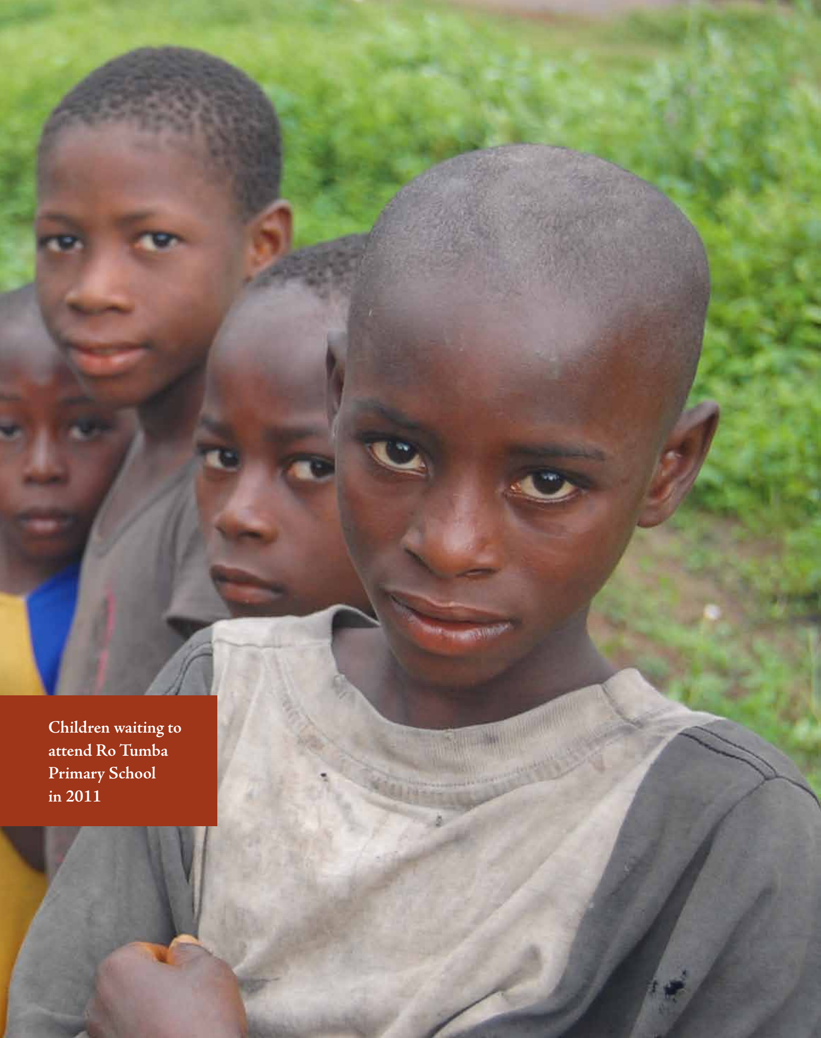
Children waiting to attend Ro Tumba Primary School in 2011