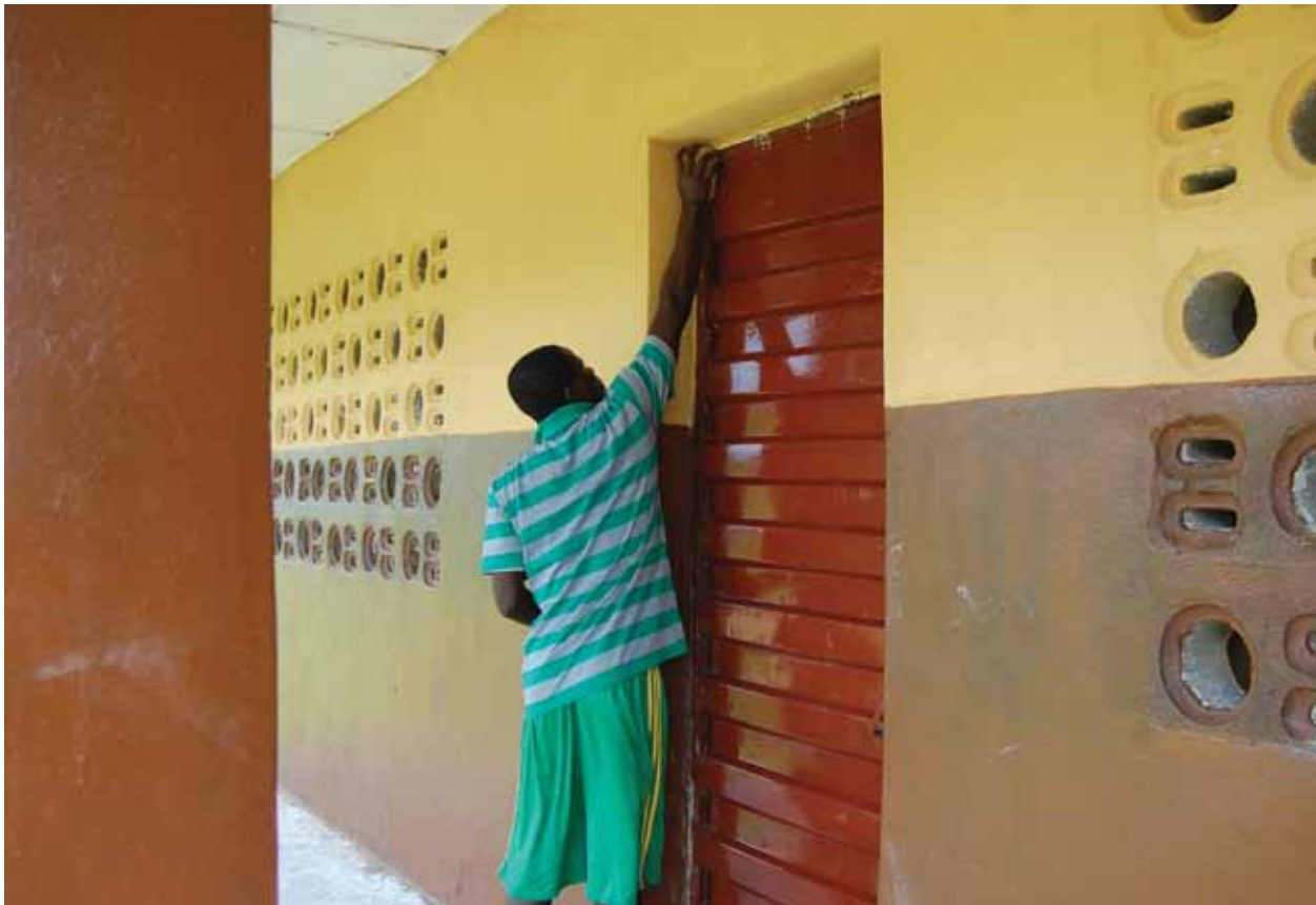
Painting of Rogbomtama Primary and Secondary School

Sierra Leone is a country at a crossroads, and Education for Hope is working in cooperation with governmental and non-governmental entities to continuously form new partnerships with interested communities to provide the material necessary to increase access to and improve the infrastructure of school buildings.