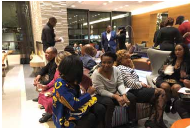
Annual Fundraising Event