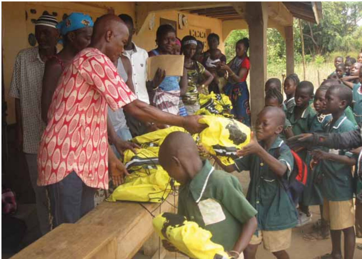
Handling of school supplies to the children of Ro'Tumba Primary School

In Sierra Leone, Education for Hope partners with the Sierra Leone Library Board, teachers, academic institutions, and community members to conduct needs assessments and to determine the best way to support communities that promote literacy and lifelong learning.