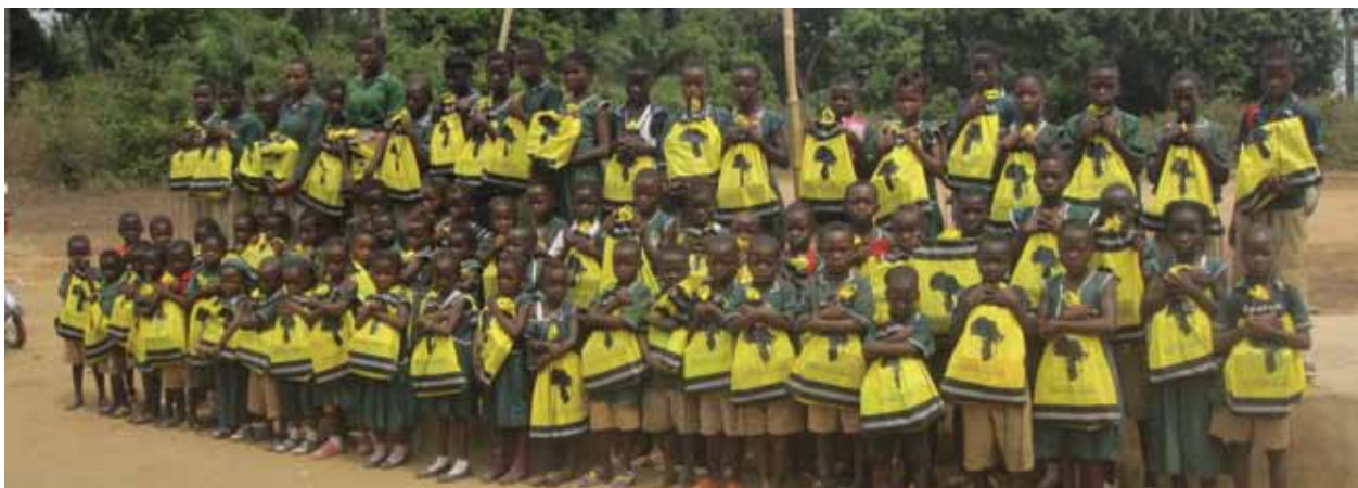
Children of Ro Tumba Primary School

Through sustainable partnerships we will work with local communities in Sierra Leone under a co-investment approach to catalyze a strong primary educational beginning including building and renovating schools, providing school supplies, and providing books for libraries. Within two decades we will build or renovate 500 schools equipped with libraries, provide 10,000 backpacks with school supplies to primary school children, and provide libraries with 1,000,000 books.